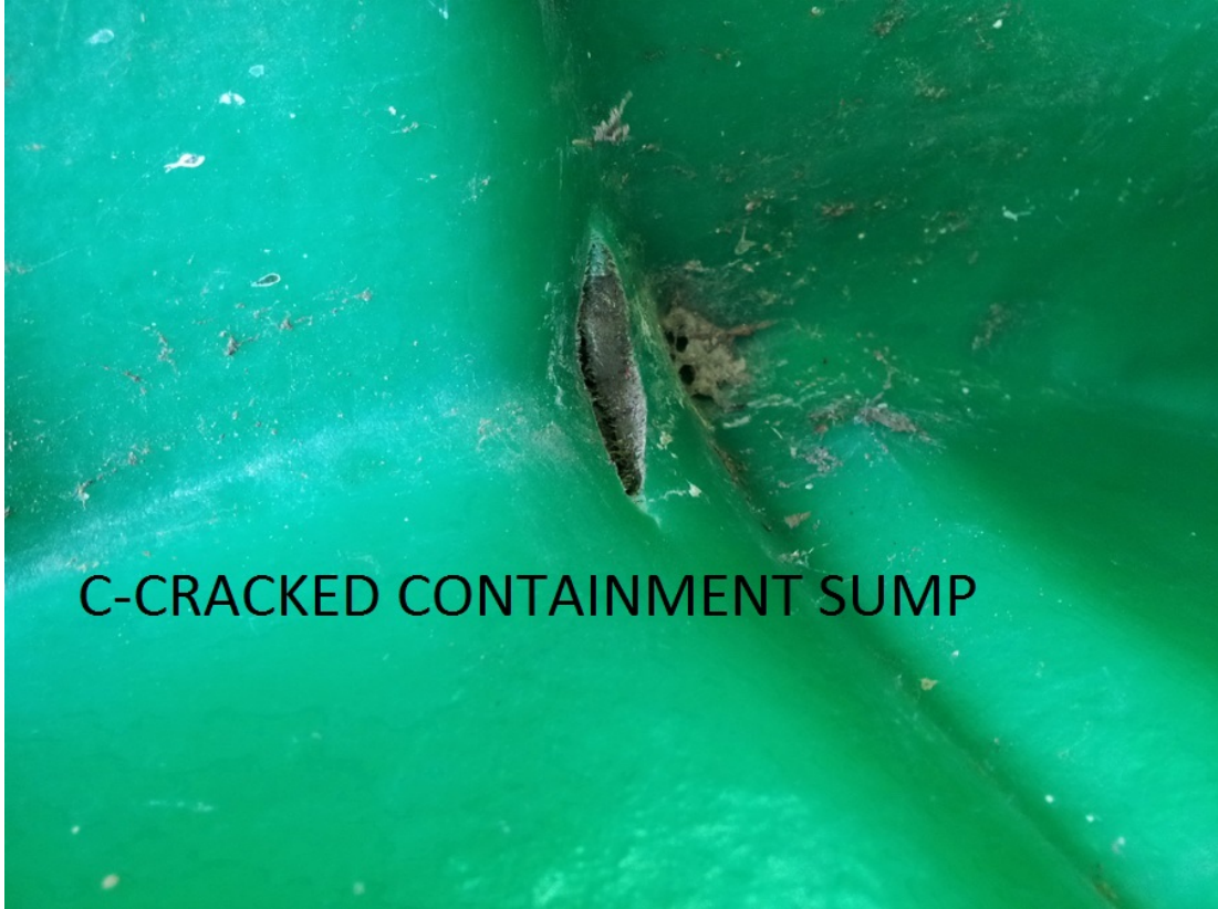
C-CRACKED CONTAINMENT SUMP