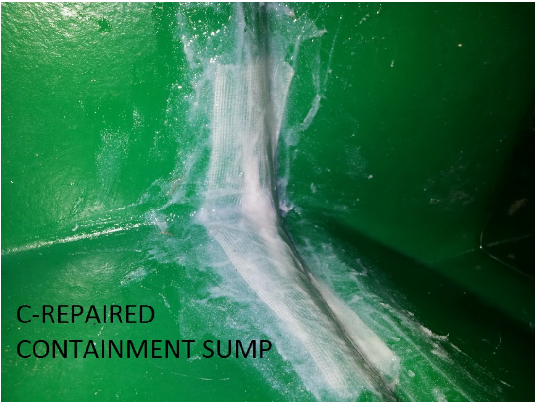
C-REPAIRED CONTAINMENT SUMP